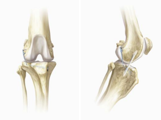
Above: Arthrex CCL Anchor Repair System